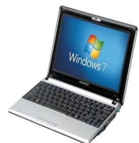
Windows (XP and higher)

Have complete confidence that all of your services are captured and recorded wherever they are provided.