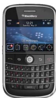
Blackberry (4.2 and higher)